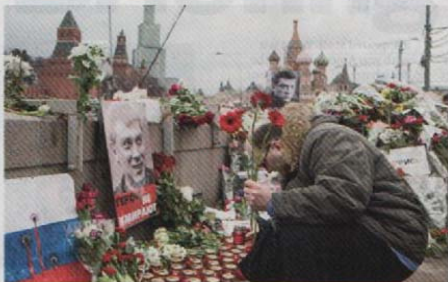
Mourners in Moscow lay candles at the site where Russian opposition leader Boris Nemtsov was killed.