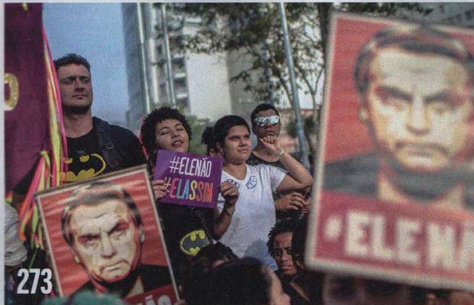
Jair Bolsonaro, front-runner for Brazil's presidency, is a scary prospect to some.