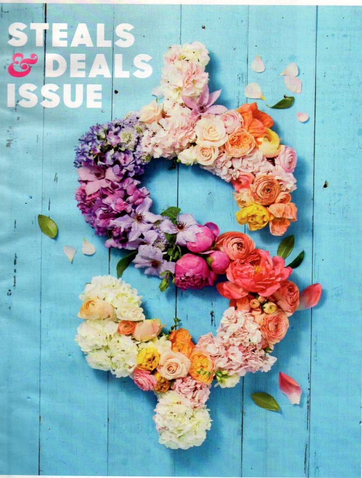
COVER CREDITS: Prop styling by Cate Geiger. Food styling by Tara Bench. Cover photo inspired by Dina Belenko.