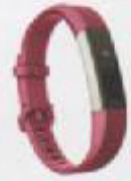
WALK FIT p. 66