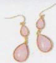
STYLE FOR LESS p. 20