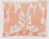
SAVE / SPLURGE p. 60