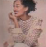
TRACEE ELLIS ROSS