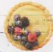
BERRY TASTY p. 117