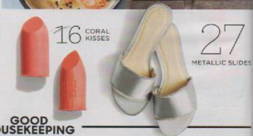
16 CORAL KISSES