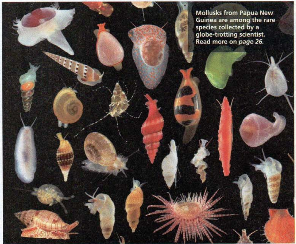
Mollusks from Papua New Guinea are among the rare species collected by a globe-trotting scientist. Read more on page 26.

The estimated number of galaxies has jumped from billions to trillions, thanks to improved tech; and in 1930, a captivated nation thought up names for a new world, known only as Planet X.