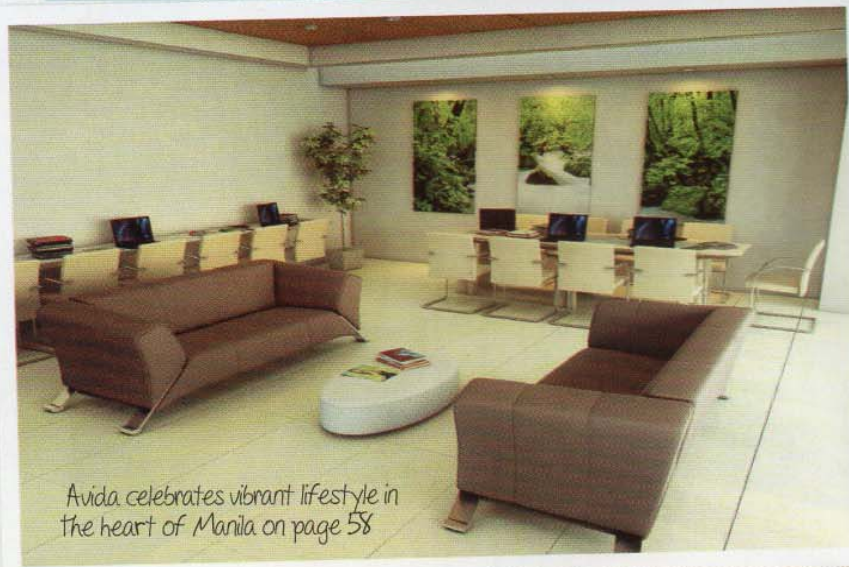
Avida celebrates vibrant lifestyle in the heart of Manila on page 58