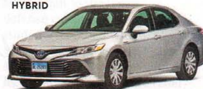
TOYOTA CAMRY HYBRID