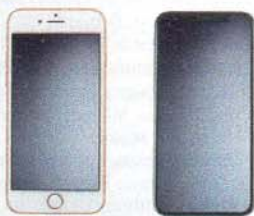
IPHONE 8 IPHONE X