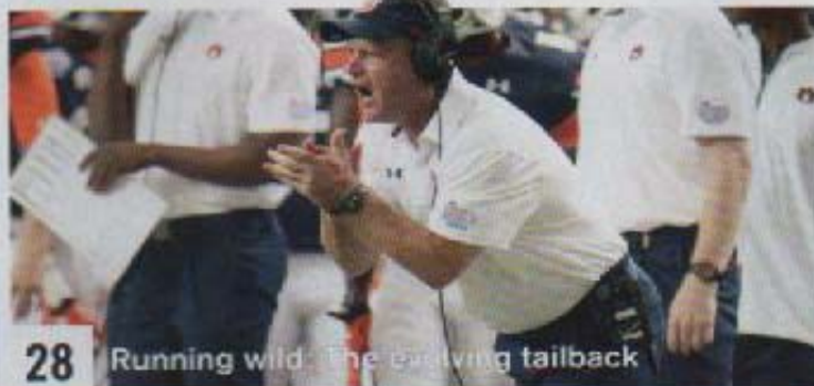
28 Running wild: The evolving tailback