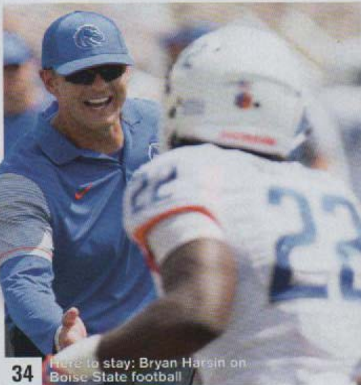
34 Here to stay: Bryan Harsin on Boise State football