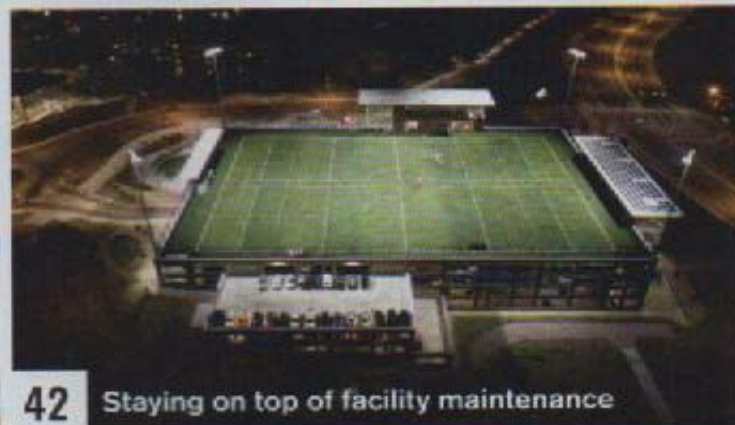
42 Staying on top of facility maintenance