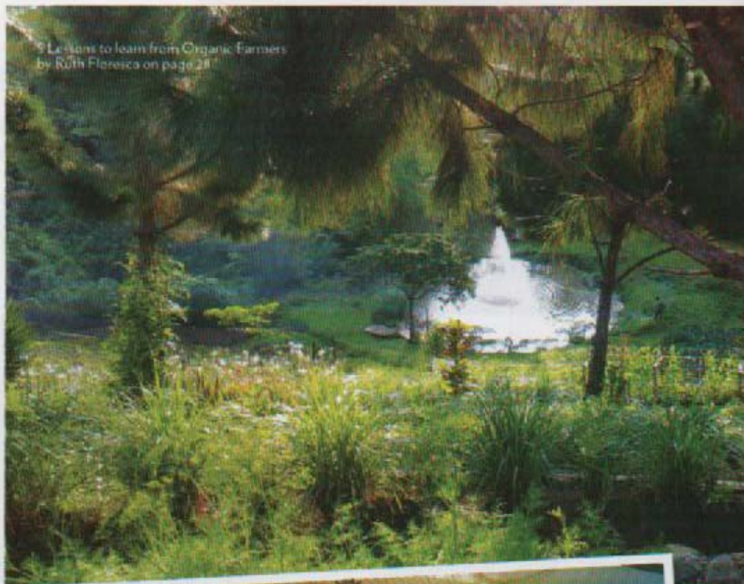
5 Lessons to learn from Organic Farmers by Ruth Floresca on page 28