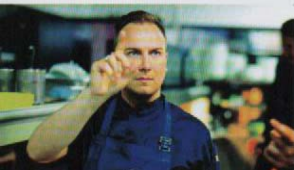
Chef's Table returns on page 11