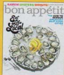
The Walrus and the Carpenter, Seattle