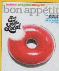
Blue Star, Portland, OR

» This month we created three covers to capture what it means to eat like a local.