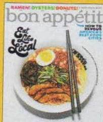
Ken's Ramen, Providence, RI