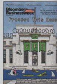
Cover: Photo Illustration by Jaci Kessler Lubliner; Photo: Courtesy Fed Reserve