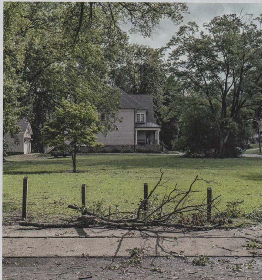
44 Charlotte was prepared for flooding long before Florence

Facebook facebook.com/ bloomberg businessweek/ Twitter @BW Instagram @bloomberg businessweek