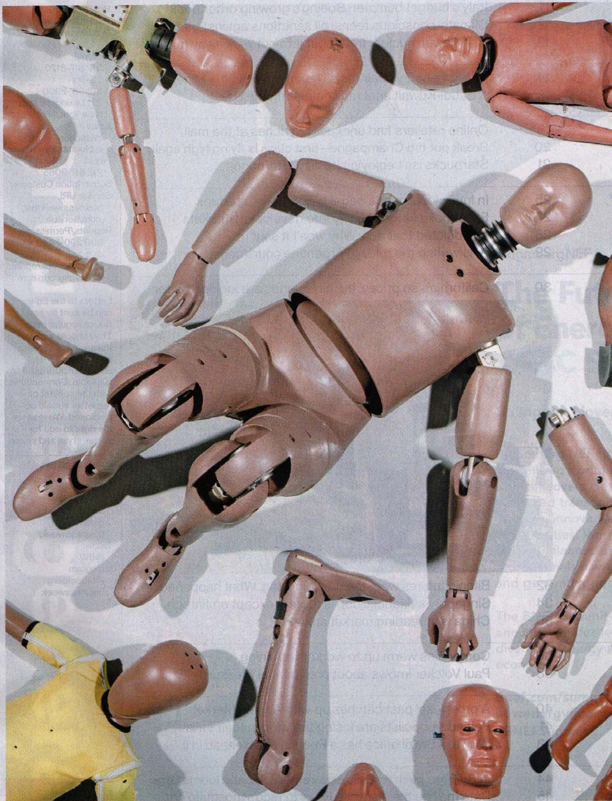
◀ The cast of characters at Humanetics