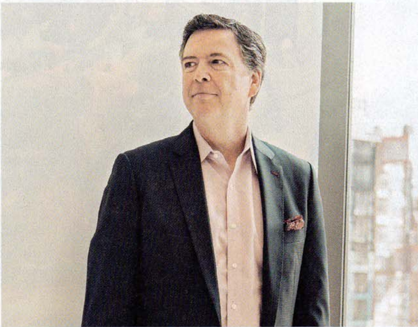
47 James Comey on Trump vs. his old grocery store boss 49 Women in Congress could see huge strides in 2018