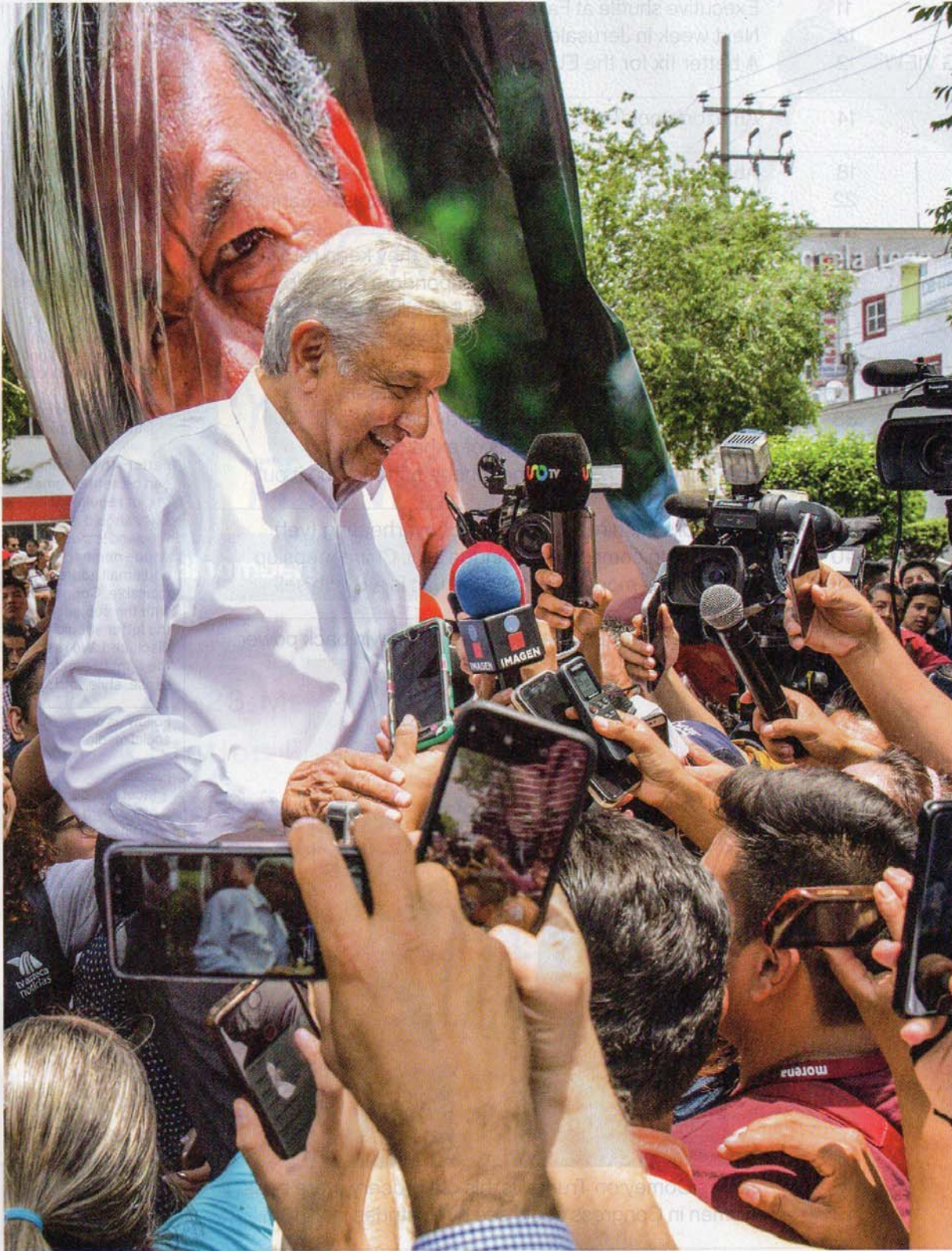
◀ Andrés Manuel López Obrador, aka AMLO, at a campaign stop in Mexico City