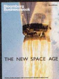
SpaceX Falcon 9 launch on April 18, 2018, Cape Canaveral, Fla.