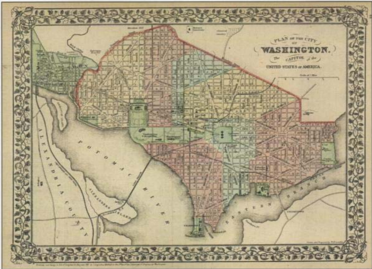
Map of Washington, DC, 1880

Journal of the American Psychological Association July–August 2014 Volume 69 Number 5 ISSN 0003-066X