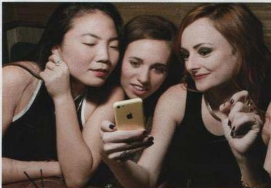
A group of friends use the dating app Tinder to play a drinking game at Baby's All Right bar in Brooklyn on Jan. 24.