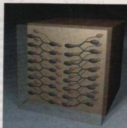
pages 258 &amp; 272