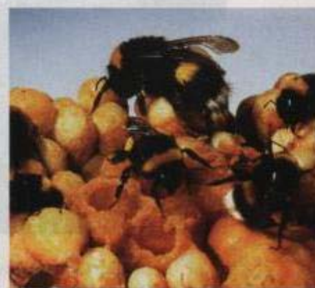
pages 254 & 287