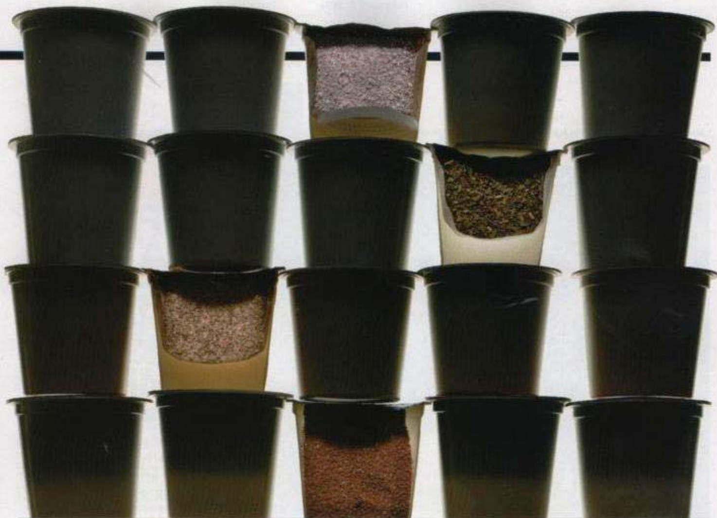
14 Green Mountain, which makes the Keurig brewing machine, is reengineering its pods and building new appliances to expand beyond coffee.