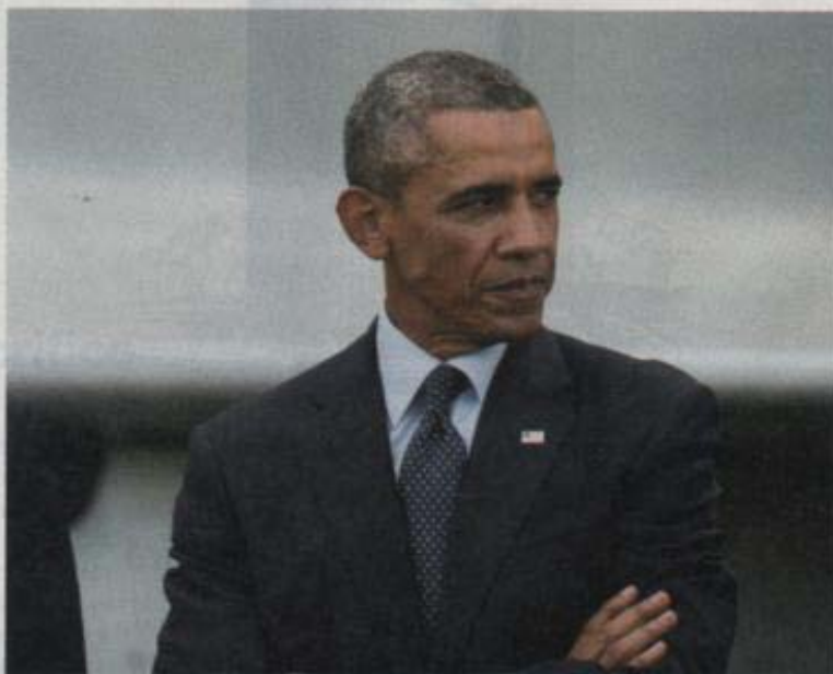
Barack Obama at a NATO summit on Sept. 5 in Newport, Wales. Photograph by Jon Super—AP

TIME photo-illustration. Hand: Milos Luzanin—Alamy