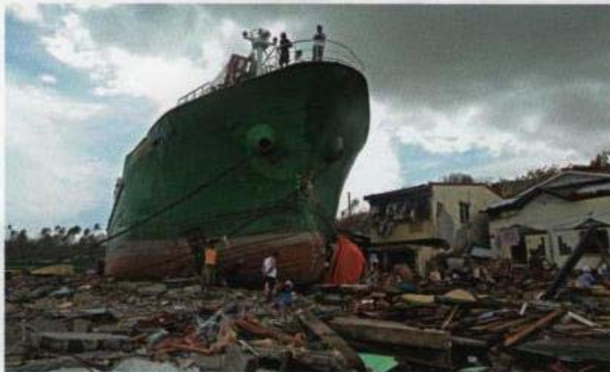
Residents of Tacloban, the Philippines, survey the aftermath of Super typhoon Haiyan on Nov. 11.