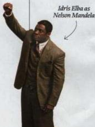
Idris Elba as Nelson Mandela